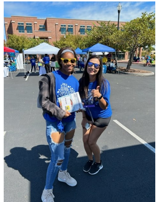
Lucky winner for drawing of book—Kingsport Lions donated: "Getting Started with the Mediterranean Diet."