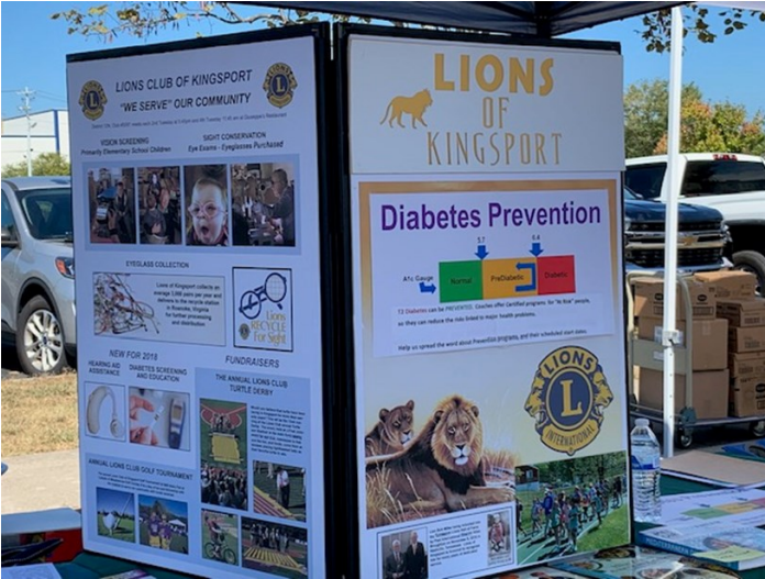
Kingsport Lions Screen for Diabetes