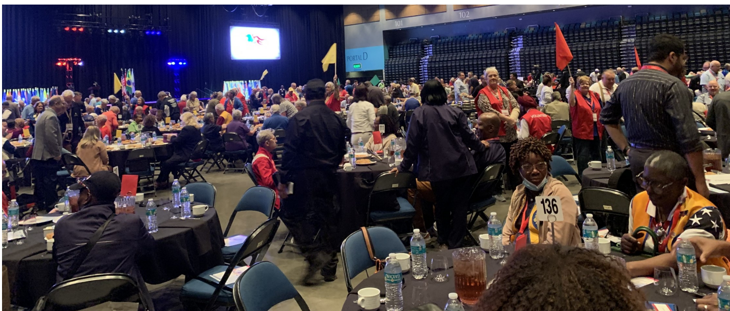
1600 Lions attended the 2023 USA/Canada Forum