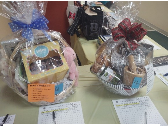
Fundraising baskets at the My People Senior Activity Center