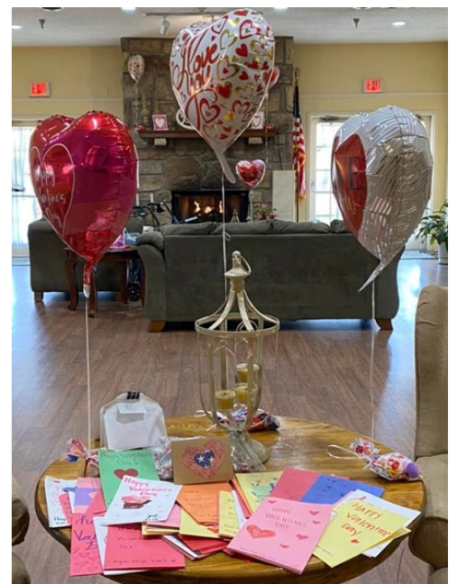
Right—Valentine cards made by the Pigeon Forge High School Leo Club members.