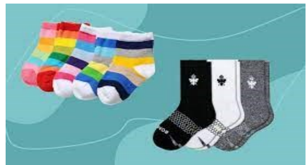
SOCKS – ALL SIZES