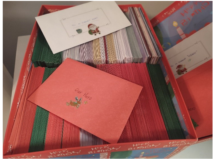
Sevier Lions prepared 660 Christmas Cards that were delivered to both the Veteran's Last Patrol and to the residents of the Ben Atchley TN State Veterans Home in Knoxville.