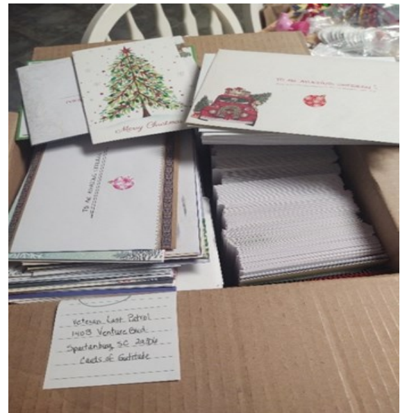
Members prepared 550 Christmas cards that were sent to the Veteran's Last Patrol, to be distributed nationwide to Hospice Veterans. This was the 3 rd year that Sevier Co Lions have participated in this project.