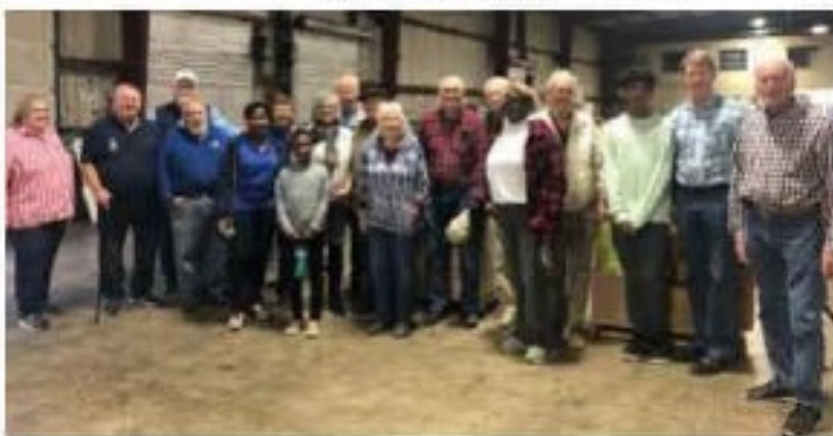
The Motley Crew!

A BIG THANK YOU to the 20 or so Lions from clubs in the District who gathered on Saturday, November 13 th to sort, box and palletize approximately 3,000 pounds of glasses. These glasses will be shipped to Respects in California for recycling. The District expects to receive some money in return and will apply this to our eye conservation programs. Half the time was spent sorting through all the boxes and pulling out cases, then putting everything into common size boxes for palletizing. What good workers – WE SERVE!