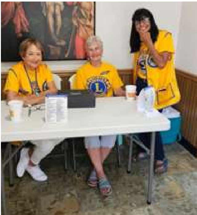
Pancake breakfast "Ticket Takers"