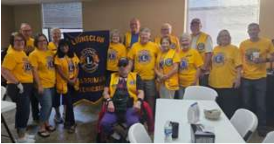
Harriman Club members pose for a photo prior to the Pancake Breakfast held on 13 June. Billed as "America's Greatest Pancake Breakfast" the event was a huge success for the club.