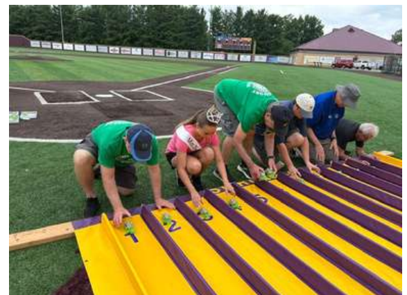
On your mark.....