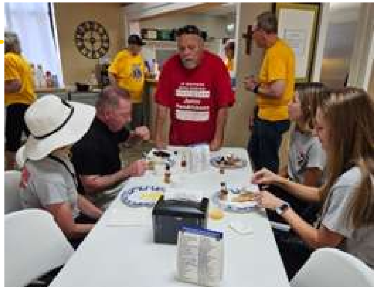
A pancake breakfast election year always brings out the politicians and ensures a big crowd.