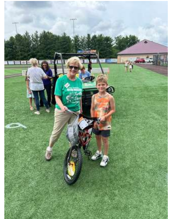
L to R: PDG Keltie with winner of bike