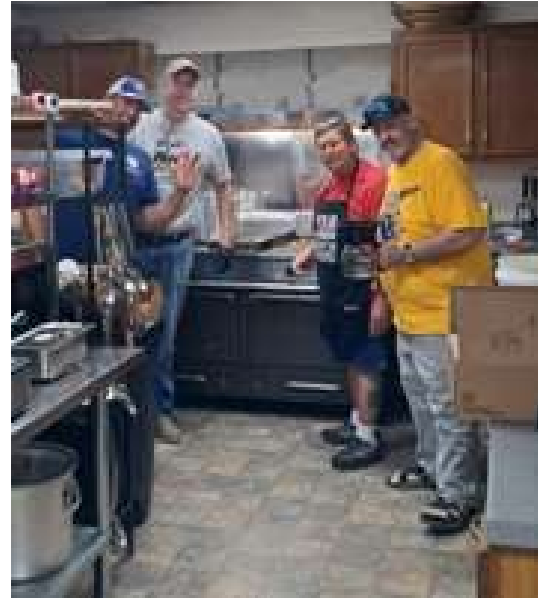
Pancake breakfast "Chief Cooks and Bottle Washers"