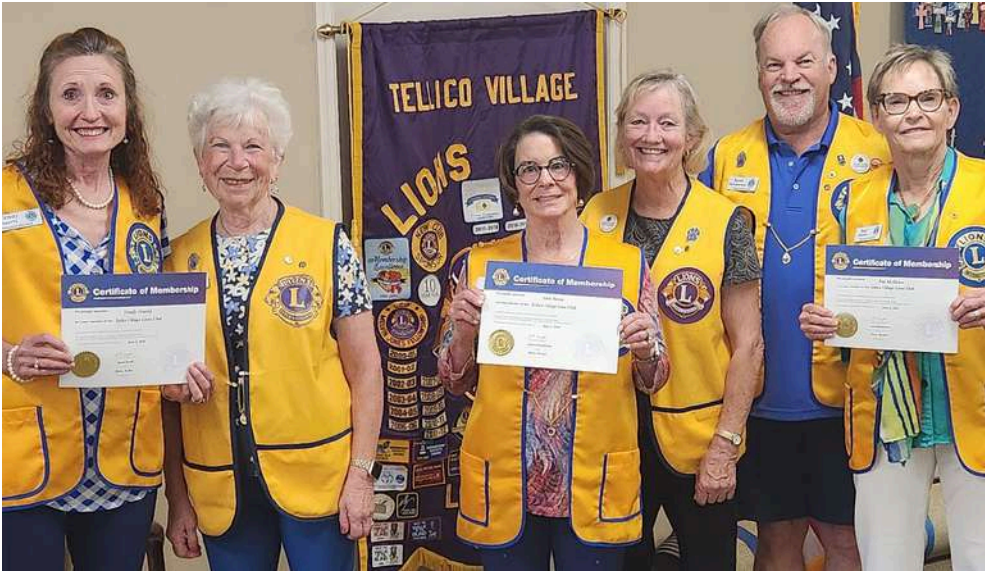
New Members of the Tellico Village Lions with their Sponsors